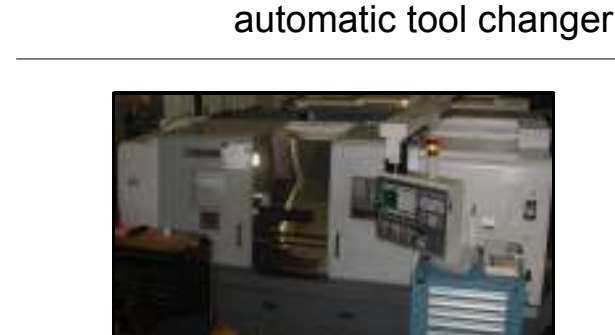
Okuma 16" swing x 48" centers w/live tooling