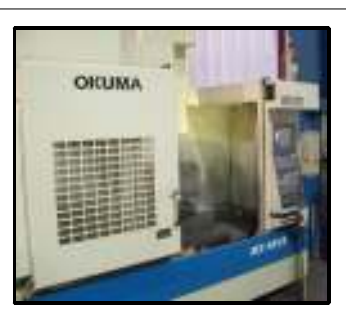
Okuma vertical machining center 20" x 40" travels w/20-position tool changer